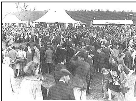
Burton Cliff Point to Point Meet 1960

The event was transferred to Market Rasen in 1991.